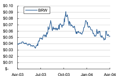
Share price performance