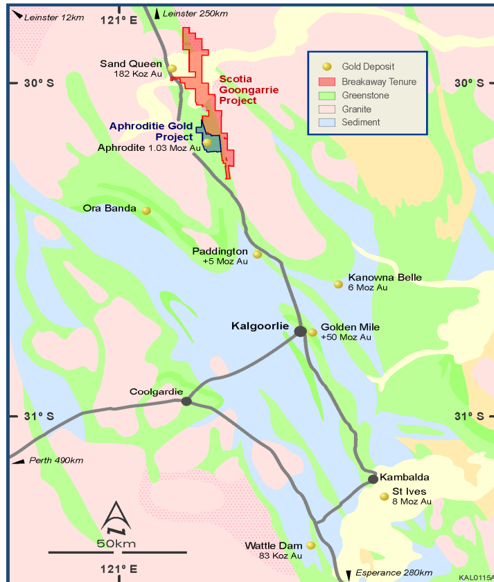
Figure 2: Location of Aphrodite Gold Project and Scotia Gold Joint Venture Project.